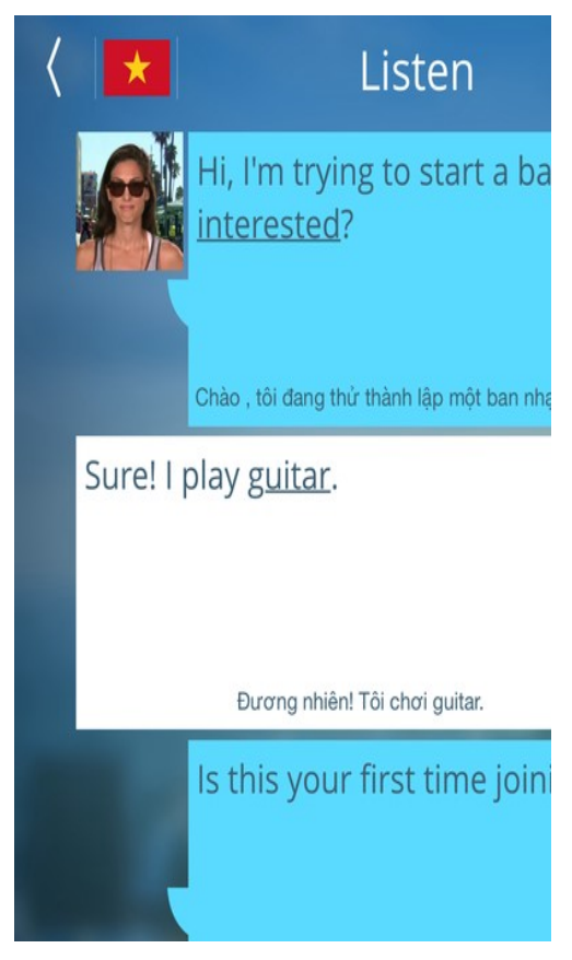
Figure 1. Dialogs

Within the dialogs, learners need to respond to the video character by reading the response that is given by the app out loud. Therefore, users can practice communicating with the other virtual character. The activity aims at getting the user to read (pronounce) the video's script as closely as possible. The vocal responding process, which comes with an evaluation, is associated with a specific sound technology, namely Automated Speech Recognition (ASR), which analyzes and converts audio streams of speech into written text using a speech recognition engine. ASR, however, does not analyze the audio semantically. Unlike Natural Language Processing which makes sense of language data, the ASR output cannot evaluate meaning or coherence, that is, it merely converts spoken language into written language - using sophisticated statistical and language analysis models (Carrier, 2017). By means of ASR, SpeakingPal can provide its users with a considerable opportunity to work on their pronunciation and accent, using ASR's Computer-aided Pronunciation Teaching (CAPT) software – it enables apps to listen to a learner's pronunciation and provide formative assessment and feedback on the accuracy of the enunciations. Moreover, the use of ASR allows the app to perform computer-based automated marking of ELT examinations - spoken examinations and quizzes - with an accuracy approaching that of human assessors. After each response, users' speech is rated using a three-