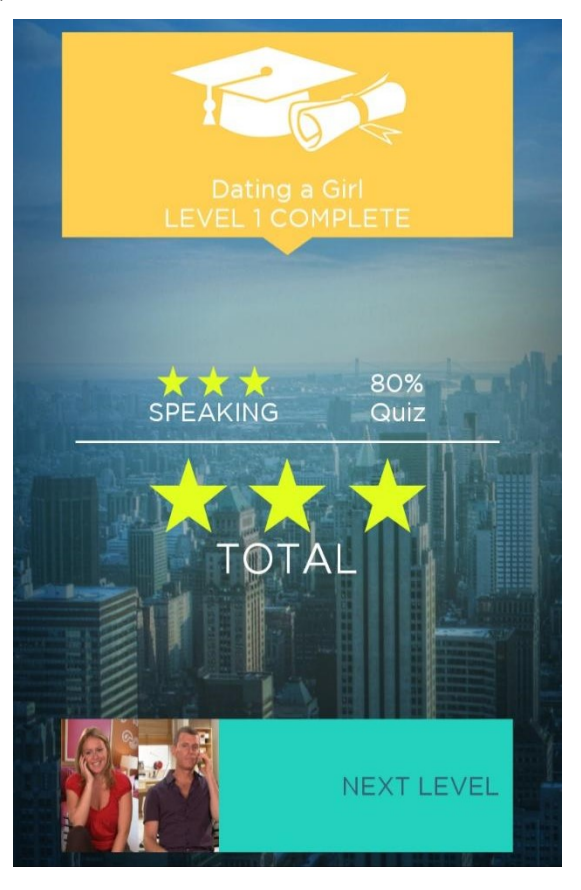
Figure 3. Scoring the performance

SpeakingPal can help promote learners' listening skill as well. Listening to the native speakers of English can help students improve not only their listening skills but also their pronunciation. After all the dialogs are practiced in each lesson, learners can take a quiz. All the questions are time-bound, multiple-choice, and based on the conversations of the lesson. However, when the learners answer the questions incorrectly, there is no feedback as to why their answer is wrong. At the end, it scores the performance as a percentage along with a three-star rating scale (Figure 3).